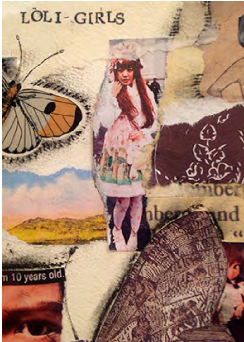
Figure 1. Excerpt from Loli-girls , 2015, mixed-media, 9 x 13 inches, Shari L. Savage

parade, or pose in doll-like stances, for one another (Winge, 2008). Men gather, too, just looking, some with cameras clicking away, seemingly tantalized by these virtual dolls. Tantalize means to excite by exposing something desirable while keeping it out of reach, which describes some of the reasons behind the looking. 2 But is it really just looking?