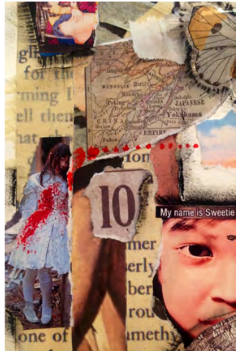
Figure 2. Excerpt from Loli-girls , 2015, mixed-media, 9 x 13 inches, Shari L. Savage

legal and freely distributed, normalize situations that should be disturbing to any human (Adelstein, 2014). For those who argue freedom of speech or reject any type of censorship of visual culture representations, I offer this rubber meets the road scenario—if you knew your daughter's soccer coach read, collected, and watched rorikon anime about young girls in sexual situations—would you allow him to be alone with your child?