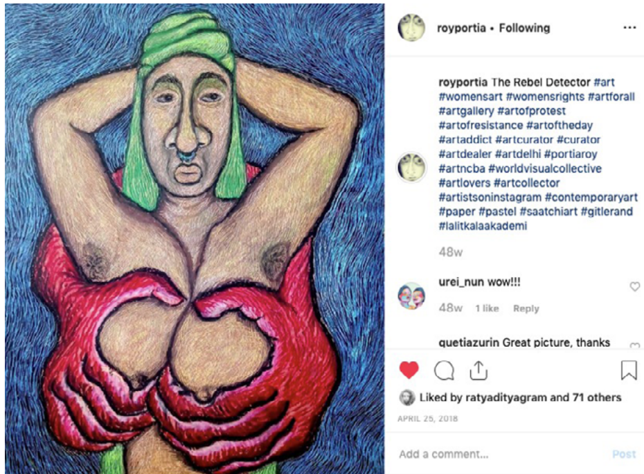
Figure 2. The Rebel-Detector by Portia Roy, a wood-board carving and acrylic (12” x 8”) posted by @royportia on Instagram, on April 25, 2018, portrays a tribal woman in the middle of an assault by a Chhattisgarhi policeman.

When Roy first read the online article (Sandilaya & Divya, 2016), she immediately wanted to forget about it and erase the memory of even reading it. However, the narrative in the article haunted her, and she decided to paint it. “There was no image in the news article, so I painted one” (P. Roy, personal correspondence, March 8, 2021).