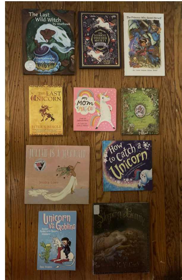
Figure 1. The photo shows a sampling of books that the authors set out for participants at their “Treasures and Tales” bookmaking workshop, as well as some additional books the workshop participants discussed. Students at the workshop used their phones and tablets to share additional imagery focusing on unicorns and other magical creatures from films and television shows that also influenced the work they produced.

Keywords: imagination, power, girl, medieval art, visual culture