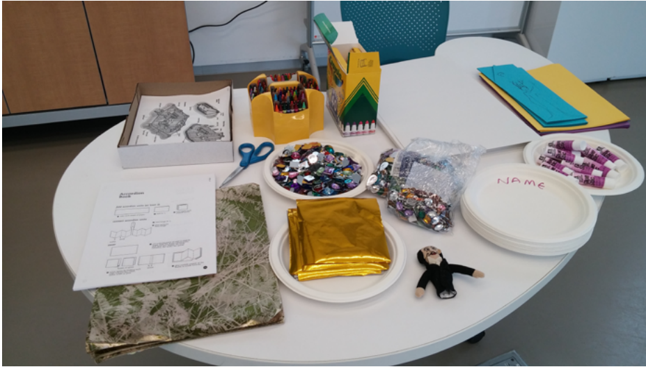
Figure 5. Harvard Ed Portal Workshop materials.

We introduced ourselves in the context of the workshop topics as teaching artists. My colleague introduced herself as a researcher who studies ancient paintings and books - often about princesses, dragons, knights, treasure, etc. I described myself as an artist who also teaches people about making things, like creating their own books and producing art about magical things they really love. We introduced the lesson as a special time to explore fairy tales the way people have for centuries, using spoken words and simple pictures or symbols to tell them with our voices, and them using books to record them, illustrate them more ornately or draw pictures to share with others in our own different ways.