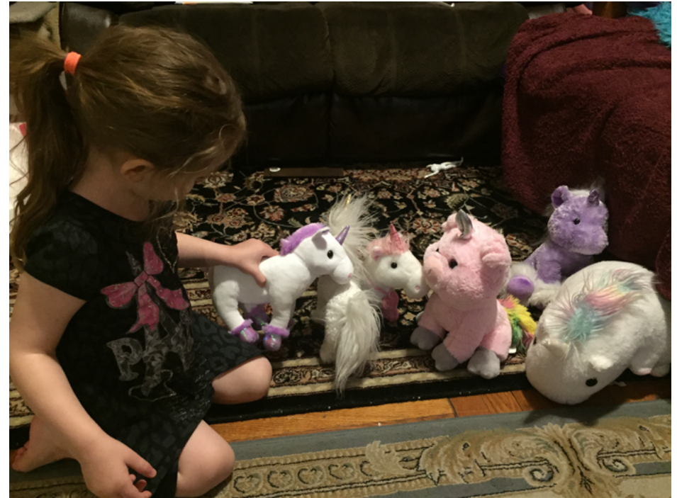
Figure 3. Author's daughter with various unicorn stuffed animals.

Looking across my own life, a thread of visual culture artifacts and memories of my youth include an array of unicorn-related visual culture from across genres, from the Unicorn Tapestries of medieval times to Tolkienesque unicorn paintings by the brothers Hildebrandt. I would later discover artist Betye Saar's subversive painting To Catch a Unicorn (1960) and appearances of unicorns in both a dream sequence of a unicorn and an origami unicorn in Bladerunner (1982). Beyond my enduring interest, I have found that elementary students today share a deep fascination with and preference for unicorns, as does my own preschool-aged daughter (Figure 3).