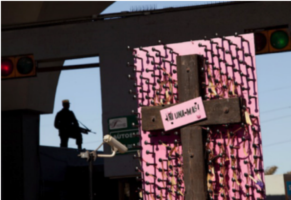
Figure 6. The cross on Santa Fe Bridge to remember the murdered women of Ciudad Juarez

The images of activists marching with pink crosses painted on their faces, the commemorative graffiti on the streets of Juarez, and the pink crosses of Campo Algodonero (an abandoned cotton field where eight bodies were first found in the early 21 st century (Sentencia de la Corte Interamericana de Derechos Humanos, 2010). Pink crosses have contributed to create an imagery of feminicidios in the city. All these images, which again constitute the FRP database, have appeared across multiple platforms consistently throughout the years, especially the pink crosses which, among other objects such as red shoes, have been used in activist organized theatre performances aimed at petitioning local and federal authorities to tackle the issue or raise awareness on the issue of the violent murders of women. In both cases, these campaigns challenged and openly attempted to debunk the myth of these murders being a ‘family’ issue and, thus, attributable to the sphere of domestic violence.