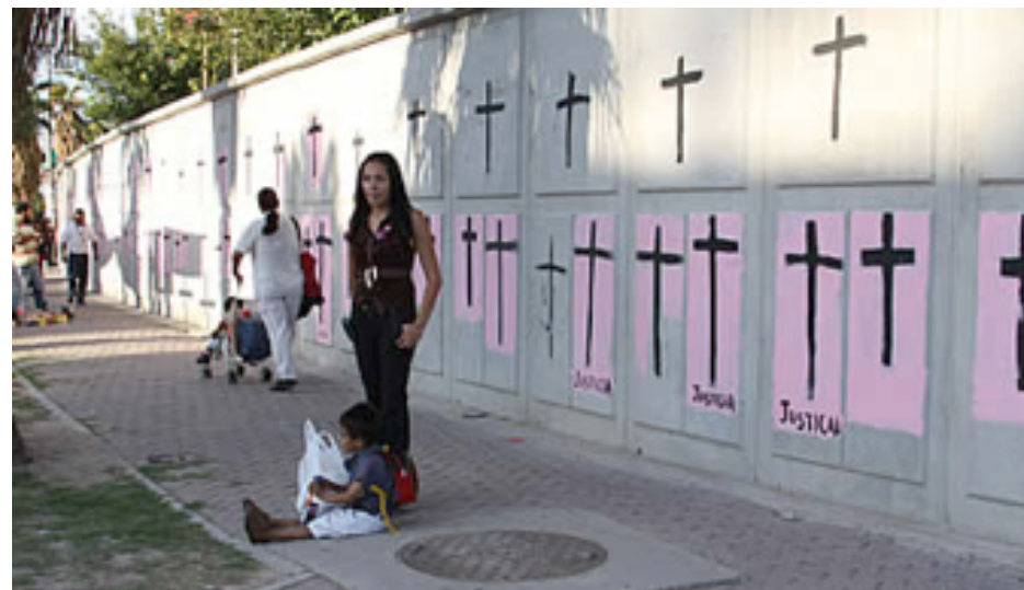
Figure 5. Mother painting pink and black crosses during the Papal visit to Ciudad Juarez in February 2016.

were painted to invite the Pope to openly accuse the city of Juarez of the political silence surrounding the issue of feminicidios.