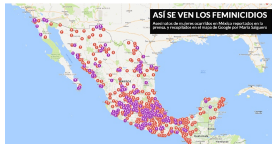
Figure 1. El mapa de los feminicidios en Mexico 2016 y 2017.

and academics involved in the discussion and the uncovering of the breadth of feminicidios have used mapping tools, such as Open Street Map and Google Maps, to pinpoint the locations and the number of murdered bodies found scattered in the city and the surrounding desert between 2016 and 2017 (Figure 1 and Figure 2).