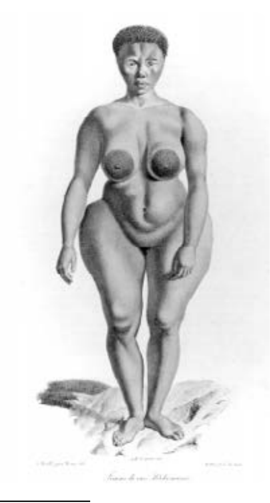
Figure 1. Femme de race Boschismanne (1824, 510 mm x 320 mm) is a hand-colored lithograph of Sarah Baartman by Wailly Leon de, pinx, & del Jacques Christophe Werner.

Venus. The variations of her name alone lead to evidence about colonial domination, possession, and mythical identities that have been commonly attached to Black women held in subjugated positions.<sup>3</sup>