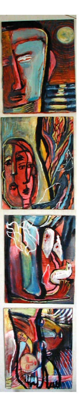
Figure 11. Paula (12"x 48", oil on canvas, 2003) by Kryssi Staikidis.

Since Paula clearly wanted a view into my world, I worked the way I customarily do. I chose a narrative theme, painted images that emerged from the stains at first created by preliminary touches of mineral spirits and washed color, and then continued the image by extending it onto four canvases instead of one. The immediacy with which I applied paint and read into marks, coupled with my lack of prior sketching, and the use of more than one canvas to extend images, were all new techniques for Paula. (See Figure 11.)