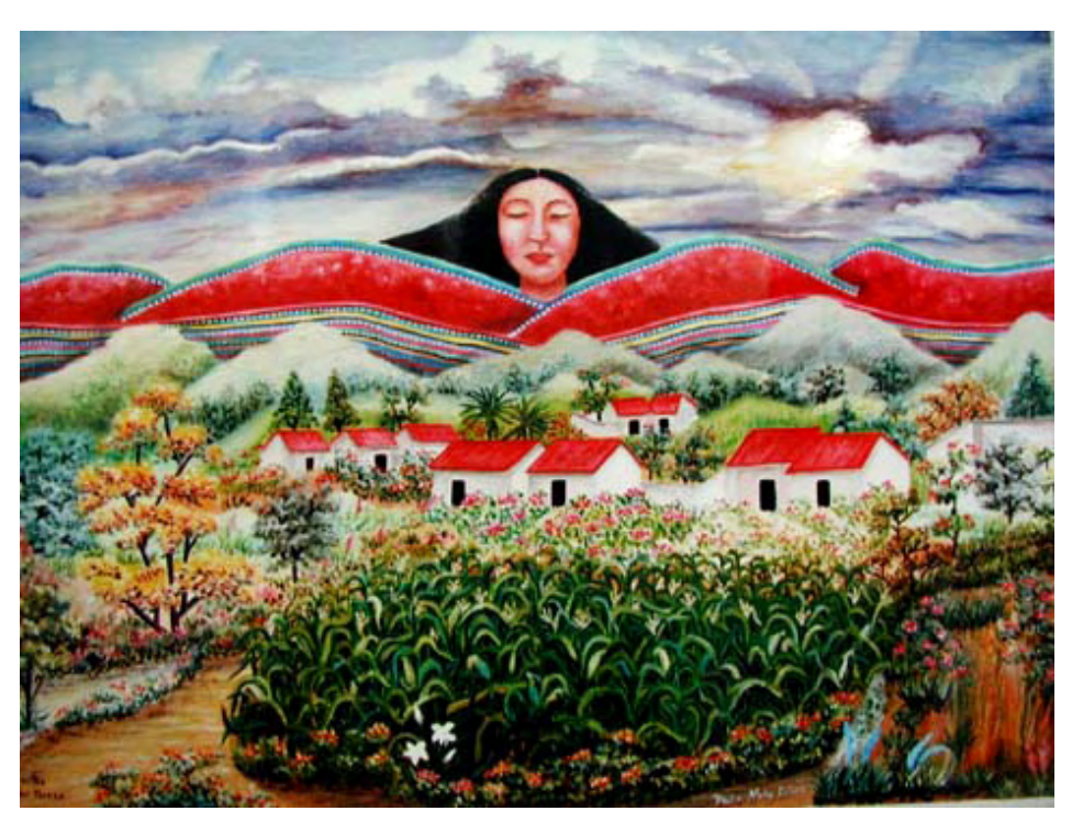
Figure 2. Mother Nature (18" x 24", oil on canvas, 1995) by Paula Nicho Cúmez.

Weaving, as a source for pictorial ideas influences the paintings of the three women painters with whom I spoke. As painters, they rely on weaving as both an artistic and spiritual foundation. (See Figure 2.)