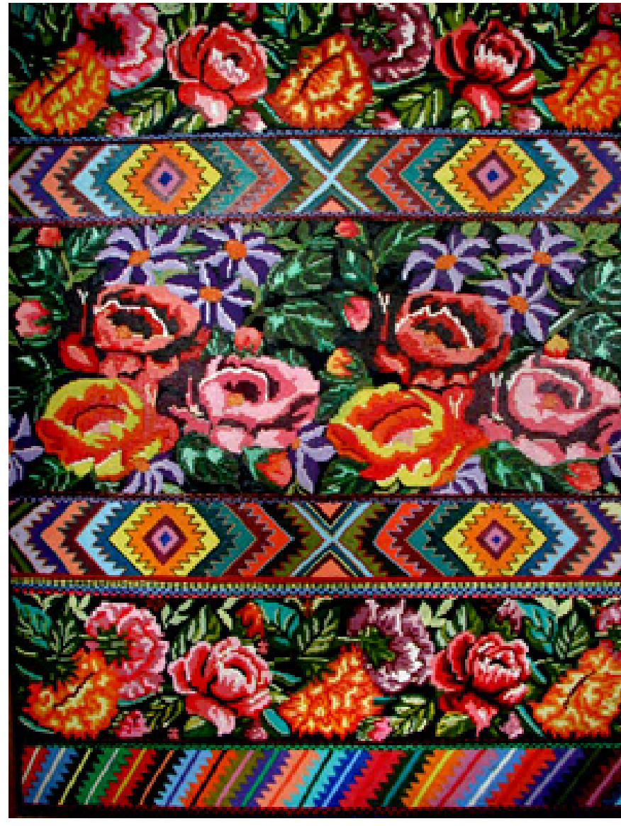
Figure 9. Guipil (18" x 24", oil on canvas, 2000) by Estela Nicho Cúmez.

Female Kaqchikel artists expressed deep concern that Mayan cultures are being threatened; the act of painting becomes purposive in that it aims to salvage cultural losses of identities. Thus, traditions, stories,