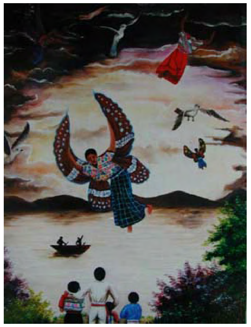
Figure 5. Feminine Liberation (24" x 36", oil on canvas, 2002) by Paula Nicho Cúmez.

my mind. I imagine it first before I draw, then paint. To dream of a woman flying symbolizes success. As an artist, I paint what is already there. (P. N. Cúmez, personal communication, June 25, 2003)