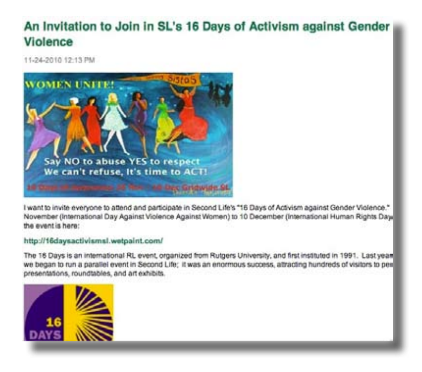
Figure 1. A screenshot of an invitation to join in SL's 16 Days of Activism Against Gender Violence posted on a SL General Discussions Forum.

Social justice groups in Second Life (SL) strategically intervened in the virtual world by participating in 16 Days of Activism Against Gender Violence in order to raise consciousness regarding gender-based acts of violence and hatred towards others that violate human rights (see Figure 1).