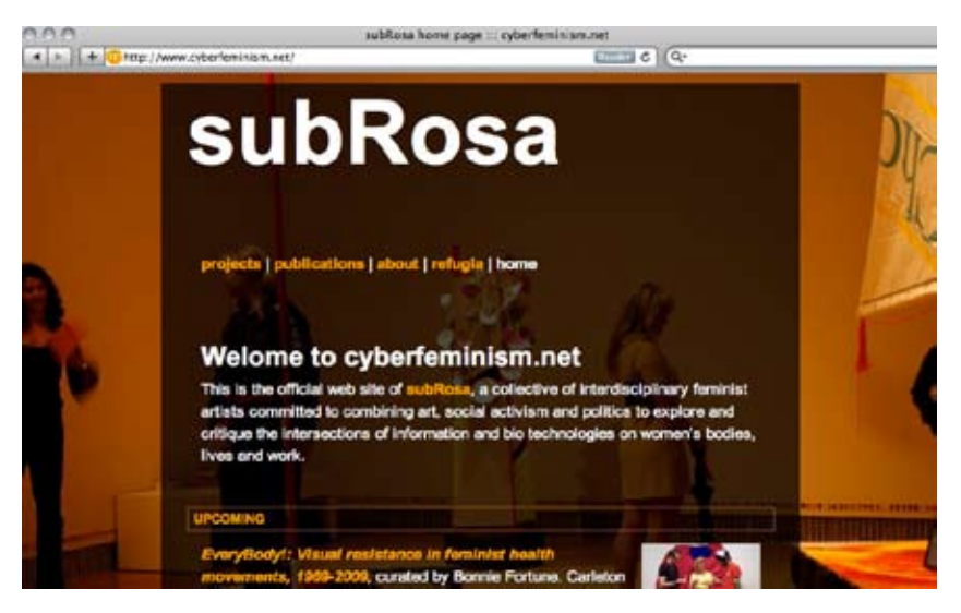
Figure 4. A screenshot of the subRosa homepage.

subRosa (http://www.cyberfeminism.net/), is a cyberfeminist cell that encourages replication by others, sends critical messages to the public by combining art, activism, and politics (Flanagan et al, 2007). subRosa uses technology as a vehicle for the creation of political art in virtual and physical space that functions as a form of consciousness-raising regarding issues women face in contemporary society (see Figure 4). The artist group's works are research-based and biomedical in nature, and their embodied feminist practice is situational (subRosa, 2009b). New media usage is a tactic employed to simulate ironic plays on reality.