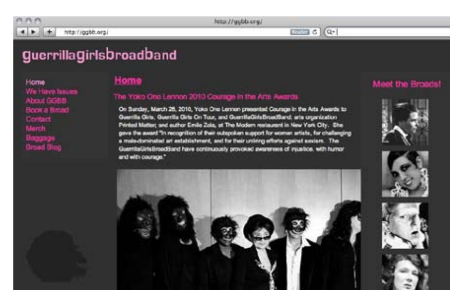
Figure 3. A screenshot of the GuerrillaGirlsBroadBand homepage.

Founded by original Guerrilla Girls members, artists of color, and younger generation feminists, GGBB claims to be digitally conscious and provides discourse on taboo subjects including feminism and fashion and discrimination in the technological workplace (see Figure 3). "The Broads" challenge social injustices, sexism, and racism via their political website (http://ggbb.org/), blog (http://ggbb.org/broad-blog/), and interactive live activist events (GuerrillaGirlsBroadBand, 2011a). The aim of GGBB is to expand GGBB's audience and extend their message from the art world to the workplace using new media communication technologies (Mirapaul, 2001). For example, in April 2010, GGBB created a digital mapping project, Cartographies of Choice , which identified abortion providers in the United States (GuerrillaGirlsBroadBand, 2011b).