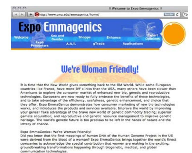
Figure 5. A screenshot of the Expo EmmaGenics homepage.

subRosa also created Expo EmmaGenics (http://www.cmu.edu/emmagenics/home/), a prank conference website (see Figure 5). This activist artwork features a list of presenters and conference themes, expert advice, and a shop with products for the biotech community. The fictional conference organizers argue that their purpose is to commend and support women's contributions to the DNA data pool and fertility industry, yet information is provided that indicates that the corporations are dominated by men (Flanagan & Looui, 2007).