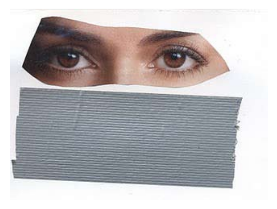
Figure 6. A visual response to the prompt: "What does The Global War Against Women mean to you?"

I guide women's creation of meaningful experience-based post-card art (see Figure 6) and publically display their work via blogs (see http://womensissuepostcards.blogspot.com/ and http://womensexperiences.blogspot.com/). My intent is to politicize women's personal experiences by posting women's experience-based postcard art on the Web where they can potentially have the most exposure and impact. I invite the public to carry on the conversation by contributing activist art to my blogs. Like the activists discussed in this article, I also aim to increase women's visual and verbal contributions to virtual world discourse through my online interventions. Strategic local resistance to patriarchal practices that is supported by a global community is too powerful to be ignored (Amani, 2009).