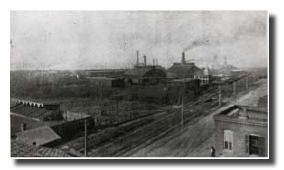
Figure 6: Libbey Glassworks in Ward One of Toledo, Ohio. Date unknown.