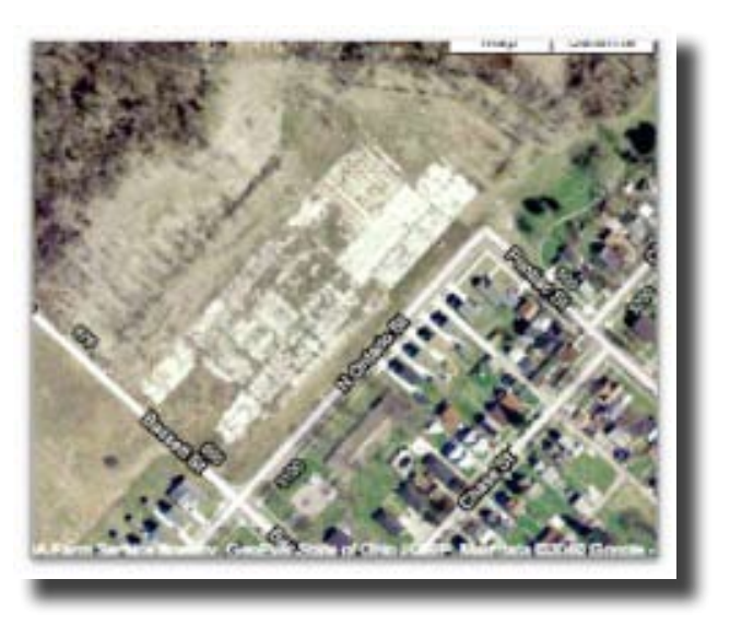
Figure 5: Satellite image of former EPA Superfund site, now classified as a Reporting Site: The former Libbey Bassett Street Warehouse.

Detwiler Ditch, named after the owner of a land syndicate in Northwest Ohio, was a vast brownfield until 1972, when the newly formed Environmental Protection Agency (EPA) designated Lake Erie a top Area of Concern (AoC). The ditch was dredged, drained, and transformed into urban green space. Today a water purification plant stands between the park and Lake Erie. The Detwiler area, bound on three sides by Lake Erie, the Maumee River and the Ottawa River respectively, was once the site of a Lbbey warehouse whose ghostly imprint remain in the land, as satellite imagery shows. The Schrag family residence at 370 Ohio Street was within 4 blocks of this environmentally compromised area, and only one block removed from the Maumee River.