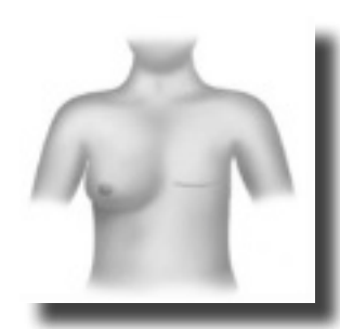
Figure 13: Diagram of a mastectomy from an oncologist's exam room.

Sonia Baez-Hernandez (2009) proposed a reconciliation of the