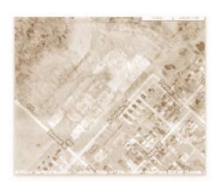
"Here, read my book"