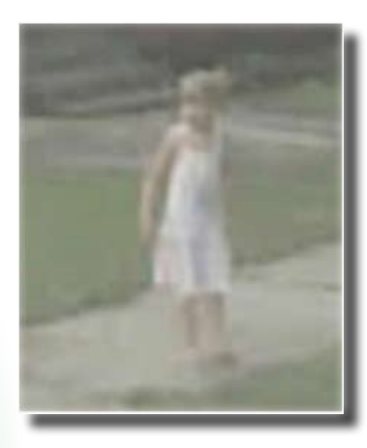
Figure 2. Child captured by Google Street View cameras in front of the residence at 370 Ohio Street. Toledo, Ohio.

The legal reasons for blurring the faces of photographed subjects are perfectly clear. They are the same for researchers who work with human subjects. I am so not sure of this clarity anymore (could the blurred faces be ghosts?).