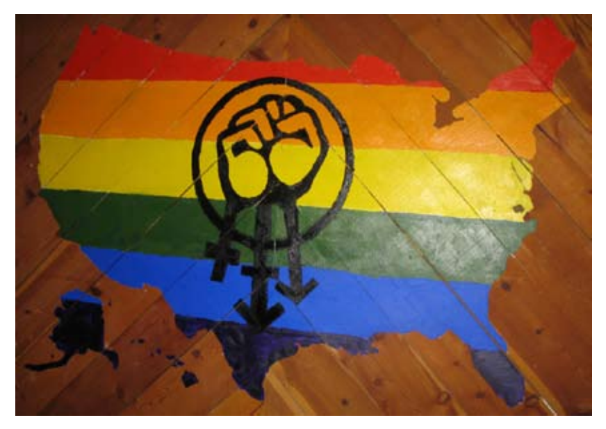
Figure 5. Student driven mural addressing gay equality

flag colors. A Black power fist<sup>5</sup> is in the center of the painted map. Each of these images is recognizable by people around the world. The rainbow flag is a universal symbol of LGBTQ or gay pride (Gay Pride, 2009). The shape of the United States is a familiar and recognizable shape. The gender symbols are understood universally. The raised fist has been used in many countries and cultures to represent power and an expression of solidarity, strength or defiance (WorldLingo, 2011). Cross-cultural communication is not just text-based, it is also image based and art often crosses linguistic barriers (Freedman, 2003 as cited in Hubbard, 2010).