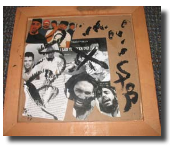
Figure 3. "STOP IT! STOP. We're all getting too old for needless violence."

in the magazines. The youth questioned if this representation could be the sole reason for stereotypes in the gay community. I believe this was a critical point in the youth's understanding of media power and its ability to concretize ideas about groups of people. The students' conversation attended to the sociopolitical inquiry, including "How are we taught to accept what is deemed truth? (Sleeter &