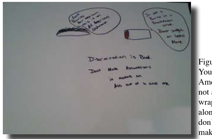
Figure 1. "Look Burrito, You're Mexican, this is an all American restaurant." "I'm not a burrito, I'm a breakfast wrap. Don't judge on looks alone." Discrimination is bad, don't make assumptions, it makes an ass out of u and me.

tion Law; however, they were instructed to create cartoons that attended to similar kinds of discriminatory acts.