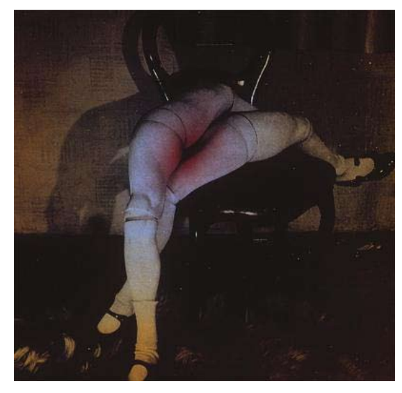
Figure 5: Bellmer, H. (photographer). (1940). Doll's Games . [Hand-colored Gelatin Silver Print], Image© 2007 Artists Rights Society (ARS), New

graphs, epitomized by his Doll's Games (1940) (Figure 5), Bellmer stripped his doll-bodies naked save for their slouching knee-high socks and black Mary Jane shoes. Bellmer then posed his exposed doll-bodies in compromising positions that intimate sexual availability and violation. Accentuating the suggestion of sexual violence, Bellmer applied an additional layer of red tinting to these photographs, especially where the doll's legs join. This extra color application intimates physical violence and bruising, as well as suggests sexual penetration and bleeding (Suleiman, 1998).