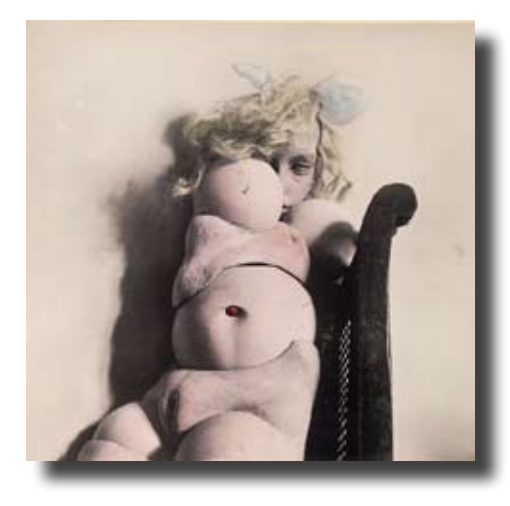
Figure 2: Bellmer, H. (photographer). (circa 1934). La Pou- pée , Seconde partie. [Gelatin-Silver Print], Image© 2007 Artists Rights Society (ARS), New York / ADAGP, Paris.

Bellmer's photographic oeuvre of grotesque, dismembered female dolls has historically been demonized as a misogynistic assault against femininity. However, when recontextualized within Bellmer's adolescence and his adult resistance to the German Nazi regime as well as comparatively re-read against the similar violent images of girls and dolls favored by Riot Grrrl bands in early 1990s U.S. popular culture, a new re-reading emerges and presents a different understanding his work and use of girl/dolls images. Under this reclaimed reading, Bellmer can be re-understood as posing a "[r]esistance to patriarchal discourse [which] takes the form of a rearticulation of girlhood" (Wald, 1998, p. 592). Later Riot Grrrls images and agendas will present a similar a resistance through reappropriated images of girls and dolls that provocatively mirror Bellmer's.