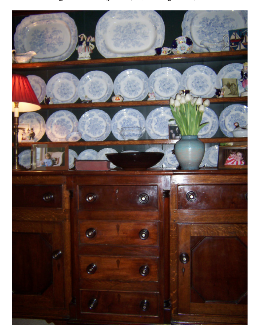
Figure 2. A contemporary Welsh dresser.

inexpensive ceramics could be purchased readily at fairs and were often given to women by family members or bought by women as a memento or keepsake. For Peter Lord (1998) these ceramics were vulgar and commonplace and unworthy of a place in Welsh visual culture. This is underlined by his use of the terms "cheap" and "popular," and his observation that such pottery was "another important expression of working-class taste and well-being at home" (p. 110). (See Figure 2.)