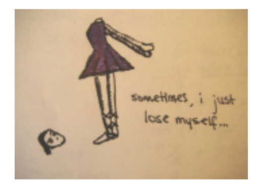
Figure 15. Journal entry by Altais

paths in life that we dare take. Good or bad memories, we thrive to move on, according to which way seems best suited for us to take. And the girl in the picture with the knife and tear blood is me. (Altais, personal communication, January 15, 2006) (See Figure 15.)