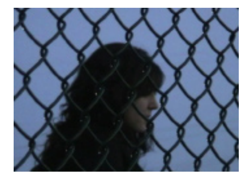
Figure 9. Video still by Claudia

Despite successful second wave feminist initiatives that laid the necessary groundwork for contemporary young girls to feel an empowerment of self that previous generations of women were not as privy to, the female gender is still governed by a political ideology that is deeply rooted in patriarchal modernist principles of power and agency. All systems such as family, peers, school, religion, culture, corporate, and government by which we females construct ourselves and are constructed by are still fixed upon notions of dominant and subordinate groups framed in terms of inequality and hierarchies based on class, gender, and age. (See Figure 9.)