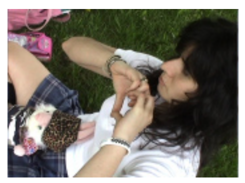
Figure 10. Video still by Lisa

Centered around students' lived experiences and using arts-based methods to intervene in one's future and re-shape a holistic sense of self, the three steps addressed in the methodology are: