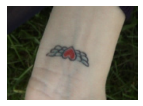
Figure 11. Video still by Lisa

and peer relationships, our adaptive and maladaptive coping skills, the meanings behind our tattoos, our experiences of getting them, and our struggles, hopes and dreams were daily sites for dialogical praxis. (See Figure 11.)