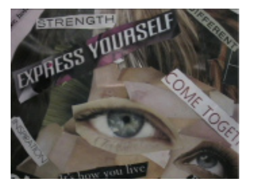
Figure 12. Collage by Leigh

Artful representation works well when it facilitates empathy or enables us to see through the researcher-artist's eye. Hearing or seeing or feeling the details of a lived experience, its textures and shapes, helps make the representation trustworthy or believable, and helps the viewer see how the researcher-artist's experience relates to their own as well as the ways in which it differs. (p. 985) (See Figure 12.)