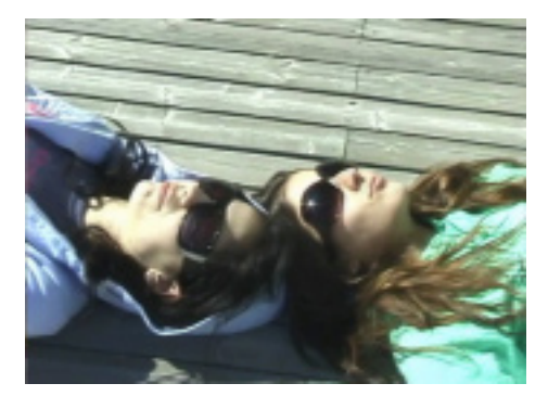
Figure 2. Video still by Chrissy and Tessy

Safe spaces break isolation, support the creation of community, and offer opportunities for the nourishment of girls' agency by means of connection and engagement (Surrey, 1991). Girls want to frame their lives, share experiences and generate knowledge grounded in their daily realities to improve the conditions of their lives (Hussein, Berman, Poletti, Lougheed-Smith, Ladha, Ward, & MacQuarrie, 2006; Levy, 2007a), and adults in female learning environments are accountable for providing girls with opportunities to engage with, understand, and transform what is [potentially] harmful. (See Figure 2.)