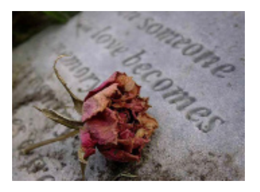
Figure 14. Image from still film Goodbye by Altais

Mistakes are what shape us, its origins are concealed in memory. It's an interconnected system. Like a dream catcher, mistakes capture what you hold dear, they capture what you thought was long gone ... I'm telling you this because I trust and love you. What triggers the stills of our lives to flashback ... ? What mistakes shape the you of today ... ? Love you for who you are. (Altais, personal communication, January 5, 2006) (See Figure 14.)