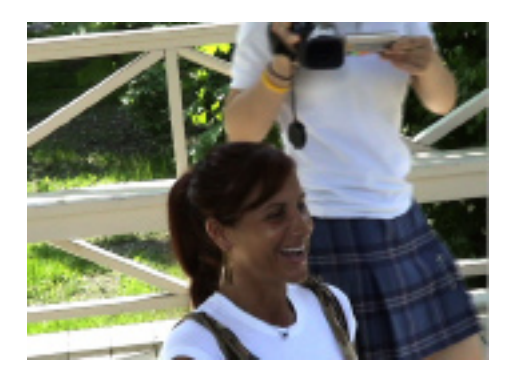
Figure 7. Student-Teacher Relationship

about girls,<sup>1</sup> all-female teaching experiences,<sup>2</sup> a professional background in media production and business,<sup>3</sup> and my personal history 'growing up girl',<sup>4</sup> I designed an intergenerational arts-based empowerment intervention methodology and positioned inner wellbeing central to initiating self-actualization and social action. To quote Dawn Currie and Deirdre Kelly (2006), "the goal of feminist empowerment is the cultivation of what we call transformative agency, an empowerment that engages girls in projects that work to change the material context of their existence. Such a strategy of intervention ... can help redefine the limits of girlhood" (p. 168). (See Figure 7.)