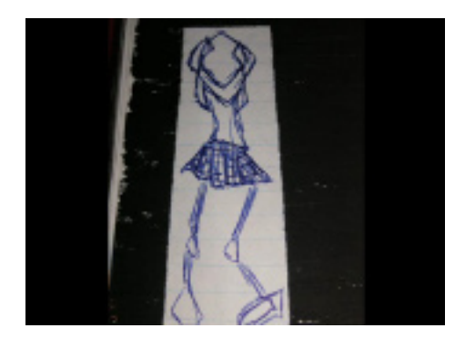
Figure 16. Illustration by Altais

Altais chose many thought provoking images to depict her memory of emotions concerning a series of events that occurred in her life, but, for me, there were six—along with her soundtrack that narrated a consistent theme of isolation, pain, and powerlessness: a girl's arm covered in cuts, a blood tear flooding out of a girl's eye, a stuffed animal covered in pins, a drawing of herself in her school uniform with no head, and arms tied behind her back, Christ nailed to the cross, and a pink haired girl with two different colored eyes followed by the words "Love you for who you are." (See Figure 16.)