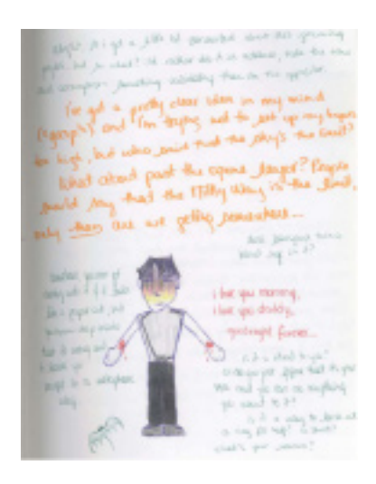
Figure 18. Journal entry by Altais: "Is it a ritual to you? Or do you just forget that it's your skin and you can do anything you want to it? Is it a way to lash out or a cry for help? A stunt? What's your reason?"

"What did it feel like to cut?" It felt horrible and yet releasing . "How did I struggle out of it?" Little by little, I collected good memories and used them to repel the dependence . (Altais, personal communication, February 16, 2006) (See Figure 18.)