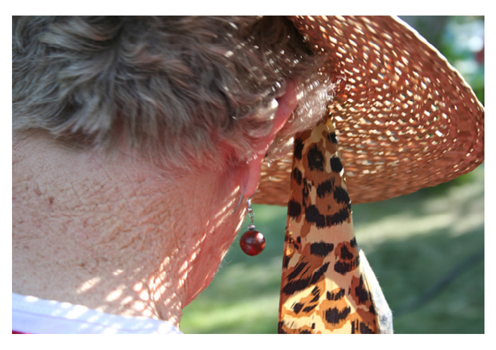
Figure 4. Ear Ring, 8" x 10", digital photograph, 2006. Photographer, Paula McNeill.

As an adult, I turned my attention from my dolls, to making portraits of people doing ordinary things. For example, Ear Ring , is a portrait of the back of a recent widow's head, hat and ear ring captured as she quickly turned her head to check on her only companion, her dog (Figure 4).