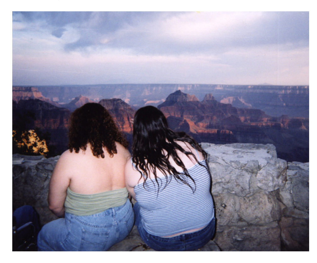
Figure 5. View from the North Rim , 8" x 10", color photograph, 2003.

For me, their monumental forms rivaled the immense rocks of the canyon below. My photographs continue the visual diary my family started in the 1940s.