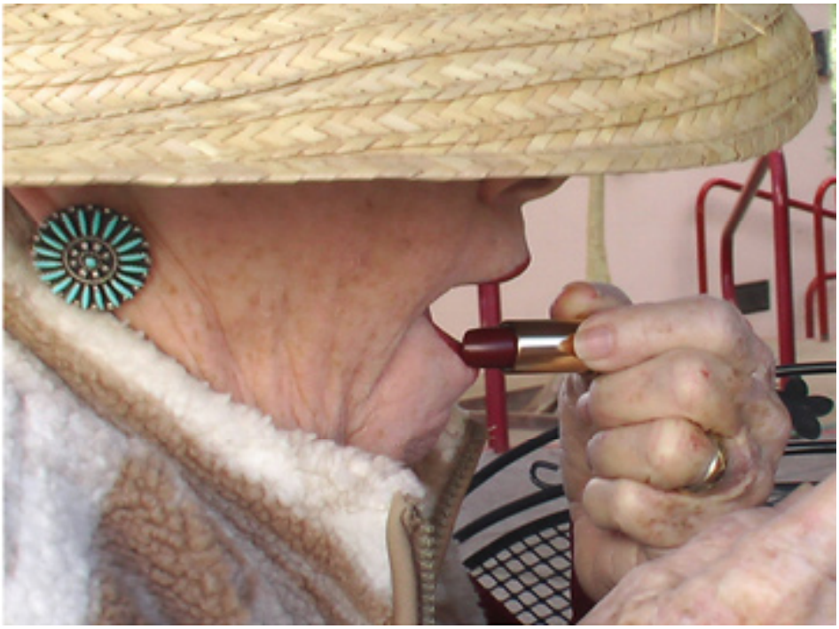
Figure 7. Lipstick, 8x10, digital photograph, 2005.

photograph, Lipstick as a point of departure for writing. Lipstick is of an elderly family member putting on lipstick, getting ready for the camera and the real photo shoot to begin (Figure 7).