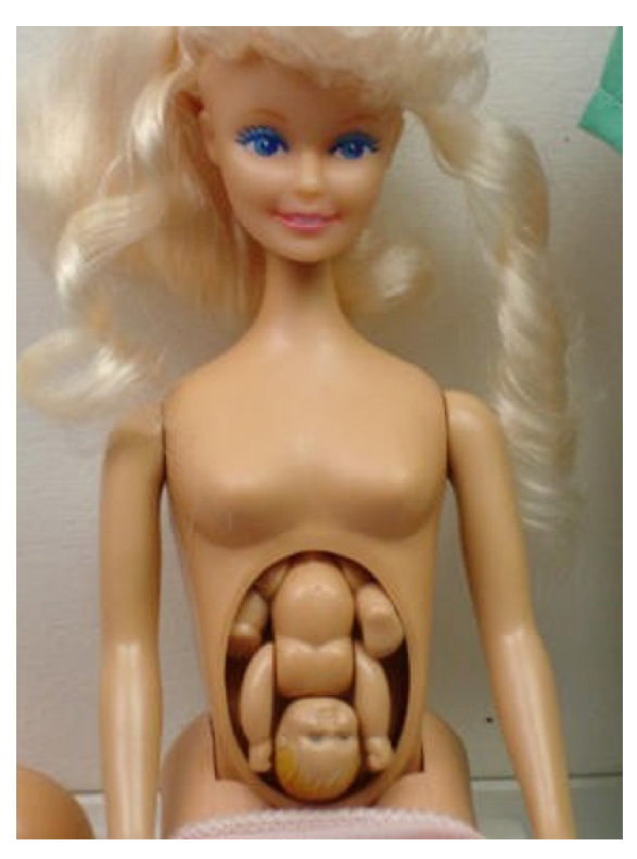
Figure 5: Digital photograph of Pregnant Midge, a Mattel® Barbie doll. MIDGE® and associated trademarks are owned by and used with permission from Mattel, Inc.©2007 Mattel, Inc. All Rights Reserved.

bate" (2002) suggested that there is a healthy aspect to having a doll that reflects pregnancy. They particularly noted that it could provide parents with entry points for discussing sexuality and reproduction, possibly doing more to reduce rates of teenage pregnancy than shielding the child from developing sexual knowledge. But it is precisely the combination of the threat of sexual knowledge and the role-playing aspect of the doll that Wal-Mart shoppers sought to curtail. Would the reaction have been the same if pregnant Barbie was simply a pregnant woman, without the removable child inside? Could cultural constraints have handled any contemporary representation of the pregnant woman in doll form? Playing with pregnant Barbie essentially becomes playing with sex, we argue, because imagery of the pregnant woman cannot be understood apart from her participation in sexuality (except in the case of the Virgin Mary).