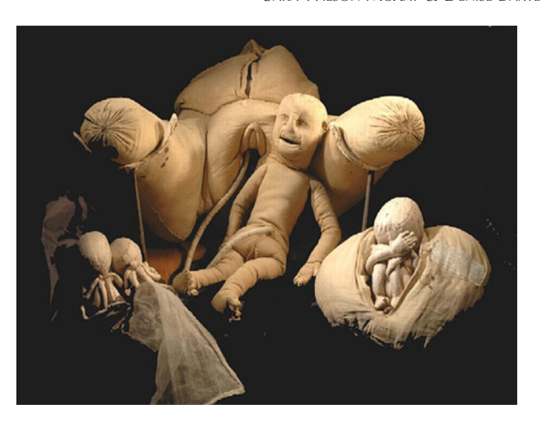
Figure 6: Angélique Marguerite du Coudray, La machine de Madame du Coudray (childbirth mannequin), before 1778, cotton, bone, leather, wood, and iron, 28 x 60 x 40 cm., Musée Flaubert et d'histoire de la médecine CHU Rouen.

Although perhaps more accurately termed an anatomical model, the most elucidating historical example of these manipulative and pedagogical possibilities may be an example from the eighteenth century, Madame du Coudray's Machine (see Figure 6). This model, currently on display at the Musée Flaubert et d'histoire de la médecine in Rouen, France, is the only extant version of what are presumed to be hundreds of childbirth mannequins produced under the auspices of Madame du Coudray, who was employed by the French monarch Louis XVI to instruct rural midwives (Gelbart, 1998). The figures, made of cloth, leather, and iron, were intended to replicate not only the dimensions of the birthing pelvis and infant, but their respective textures and rigidity in order to provide the novice midwife with as realistic an experience as possible. The doll-like figures signify the clinical aspects of the maternal. There is no upper torso, no head, and incomplete legs, these parts being inessential to the task at hand. Madame du Coudray's own term for the dolls, her "Machine" or "Machine d'accouchement" ("childbirthing machine"), further indicates that the maternal body exists to deliver the infant, a future citizen of France, unto the world.