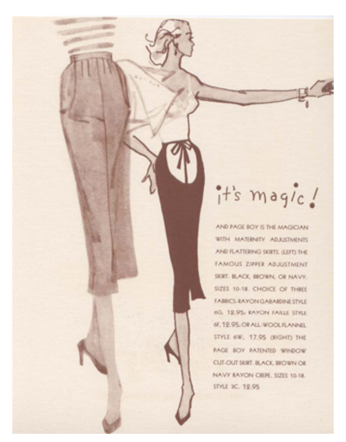
Figure 1: Scan of Page Boy Maternity catalogue page, Spring 1953.

A Dallas-based company, Page Boy Maternity was begun by Elsie Frankfurt and her two sisters in 1941 with $250. By 1955, the company had made its first million (Gross, 1961). The upscale maternity line was revolutionary in its development of "THAT hole in maternity skirts to keep the drape straight" (Texas Fashion Collection, 1961), a patented cut away from skirts that resulted in the skirt having a waist-band with a large hole cut out below it to accommodate a growing belly. (See Figure 1.) The now commonplace maternity panel, a gusset sewn into garments to cover and stretch with the pregnant belly, clearly has its origins in the concept put forth by Page Boy.