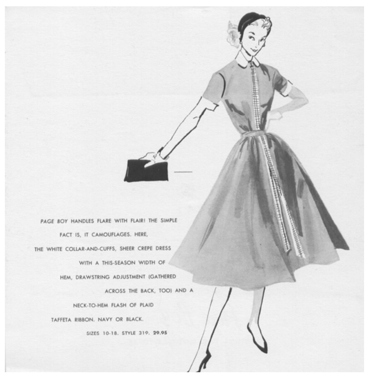
Figure 2: Scan of Page Boy Maternity catalogue page, Spring 1951.

A content analysis of four promotional catalogues for this company suggests that the pregnant belly should be hidden and streamlined beneath elegant clothing that belies the pregnant state of the body. It is within and against this kind of rhetoric and visual displacement of the unbounded aspects of the pregnant body that Page Boy produced the pregnant dolls. The so-called "monstrous" quality of the pregnant body is effaced in the Page Boy materials and historicized in the dolls. Why did they go to such lengths to historicize pregnancy visually in the dolls, and yet deny its visual representation in their advertising materials? The social status of the pregnant woman and her functions within a gendered