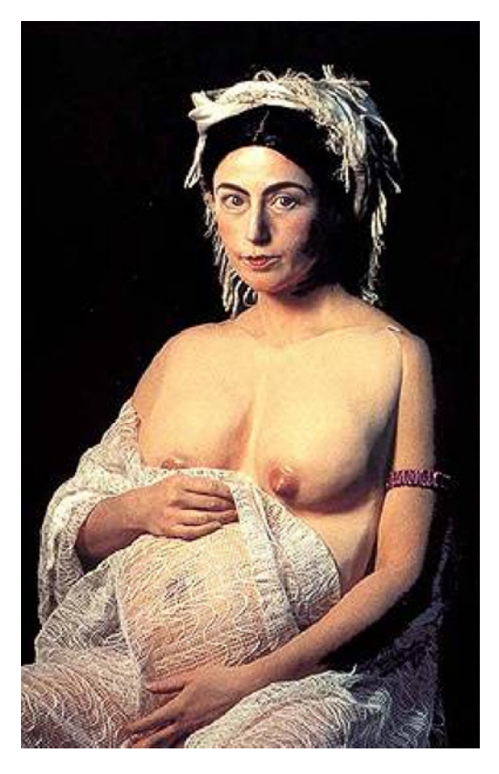
Figure 3: Cindy Sherman, Untitled #205 , 1989, color photograph, 53 ½ x 40 ½ inches, The Broad Art Foundation, Santa Monica, courtesy of the Artist and Metro Pictures.

precedent, deny the fetishistic quality of the sexualized female subject/object of the original.