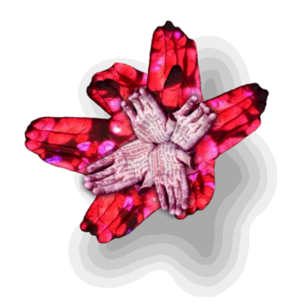
Figure 6. This looping animated, gif, Nymphaea Gif (2/2) , offers another closein view of one of the bodily water lilies, opening and closing infinitely.

an assemblage of fragmented body-like water lilies/water lily-like bodies (see Figure 6)—queer, tentacular bodies that blur the thresholds between human and plant, between "male" and "female," and between individual and multiple. The hands are signifiers for communication, care, tactility, sensation, giving, receiving, and creating; in other words, signifiers for the erotic.