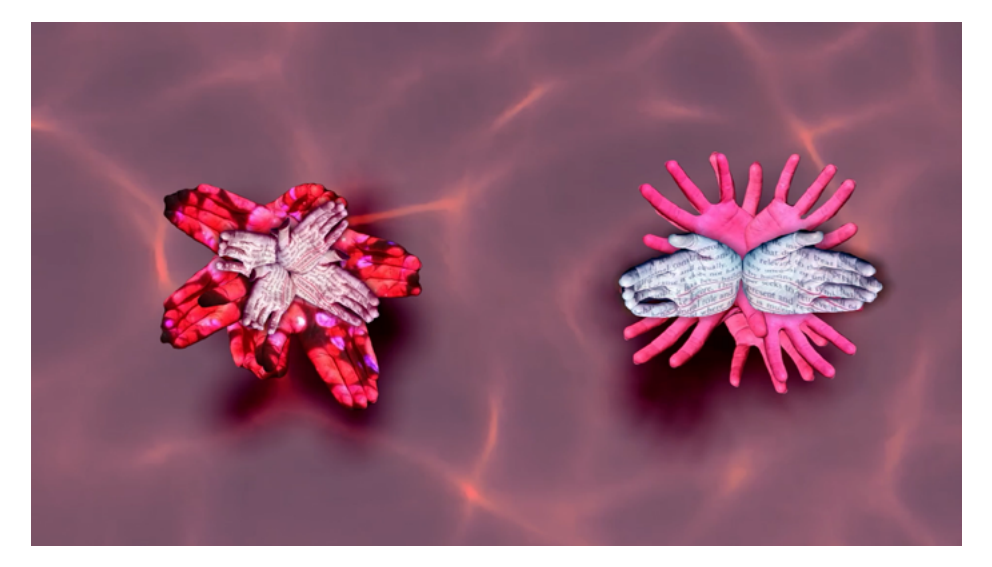
Figure 2. In this still from our time-based work, Nymphaea , two biomorphic shapes made of layered human hands form two water lilies floating together in a body of water.

In co-creating Nymphaea , we explore alternative modes for representing the water lily, drifting away from stereotypically gendered and anthropocentric visual tropes, while still visibly incorporating the human body. In Figure 2, a still from the 10-minute stop motion animation, two amoeba-like shapes comprised of layered images of hands, arranged like flower petals, form a pair of bodily water lilies. The red, purple, and bubblegum-pink tones reference the hues found in the nymphaea genus. As the centers of the bodily flowers emerge, they are overlaid with projections of underlined and annotated text from Gibson and Gagliano's (2017) essay. The projection of the images and text onto the performing bodily assemblage serves as a visual representation of the text as a lens, shaping our exploratory making and thinking with feminist/queer theory from the transdisciplinary field of queer ecologies (Mortimer-Sandilands & Erickson, 2010).