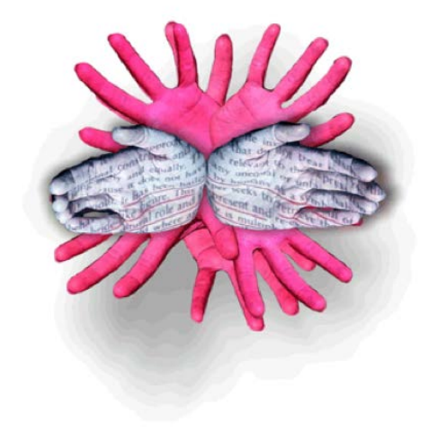
Figure 5. This looping stop-motion animation, Nymphaea Gif (1/2) , offers a closein view of one of the wriggling, water lily-like forms from the longer stopmotion animation. Included courtesy of Maggie-Rose Condit-Summerson and John Summerson (2021).

We cut out and duplicate Maggie-Rose's hands using post-production editing software, assembling and animating flowers that float around the visual field. The fingers form the tentacular water lilies, reaching out in syncopated rhythm, as though calling out to their nearby partners (see Figure 5). The floral forms are retimed to loop endlessly and are shifted on the timeline, mimicking their surrounding nymphaea , but resisting a uniform rhythm.