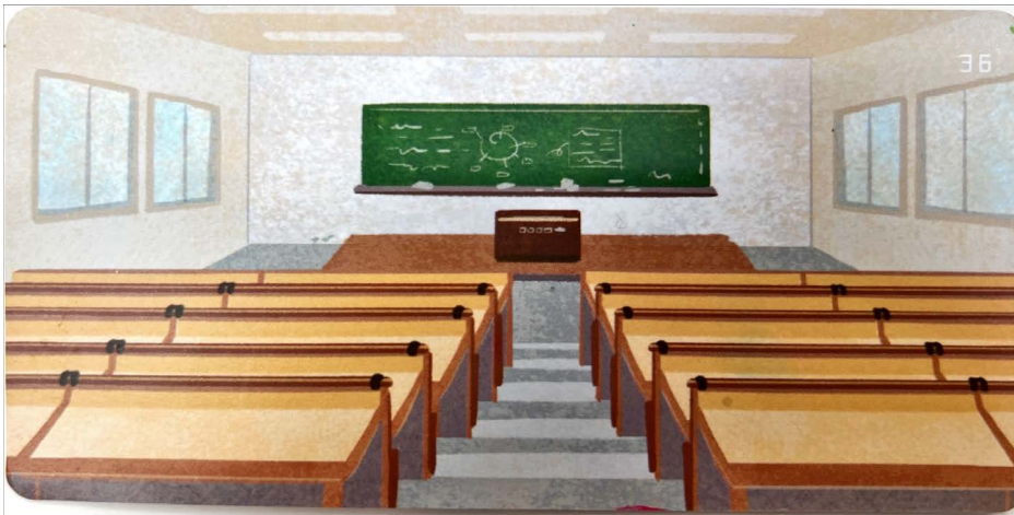
Figure 2. The digital drawing created by the me, in 2024, represents the traditional educational setting in Taiwan. The dynamics of authority are often symbolized by the educator's position in the classroom in relation to the students. In the center, there is a blackboard and lecture table denoting the highest position of power in the classroom, which is my reflection on the power dynamics imposed by seating arrangements in my classroom.

The idea of chair pedagogy comes from my experience as a visual art teacher in a public high school in Taiwan. As a teacher, my chair was larger and higher than the students' chairs (see Figure 2). Therefore, the teacher's chair, in the Taiwanese classroom, represents unspoken power to elevate status and grant me, as teacher, substantial control, deemed both my right and duty in the classroom. The elevated nature of my position led to moments where I unintentionally overlooked the equality and non-hierarchy that should exist between myself and others.