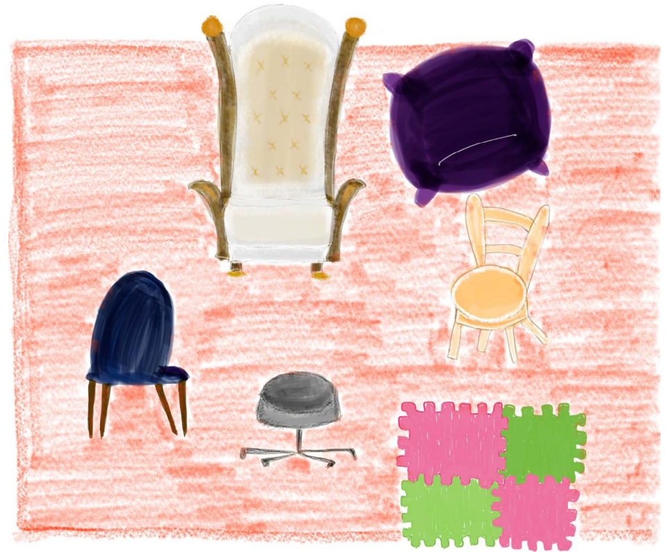
Figure 7. The digital drawing depicts six distinct chairs in one room, each with its own unique and powerful symbolism. The chairs are positioned in different places, some lower and others elevated. The inclusion of wheels on some chairs adds a layer of mobility, while others seem firmly rooted in their positions, each with its own symbolic power. This drawing is a reproduction courtesy of the participants in my art devotion group.

Figure 7 is a drawing by a woman in my art devotion group who was based in Taiwan and travelled around Europe regularly. She spiritually participated in art devotion every day and found a renewed connection with her birth family by doing so. She travelled Europe for a long time, and on one of her journeys, she visited a French household. There were five family members, and the living room was filled with various chairs including a sofa, a chair on wheels, well-worn chairs, and a floor mat. Each member sought the most comfortable way to relax with different chairs, sometimes preferring someone else's spot. For example, the older family members used larger and more comfortable chairs, whereas the younger ones used small and lower chairs. All of these chairs can be reorganized in various areas of the house and the multiple positions of the people in the same space, as well as the time to gather in the same and different times.