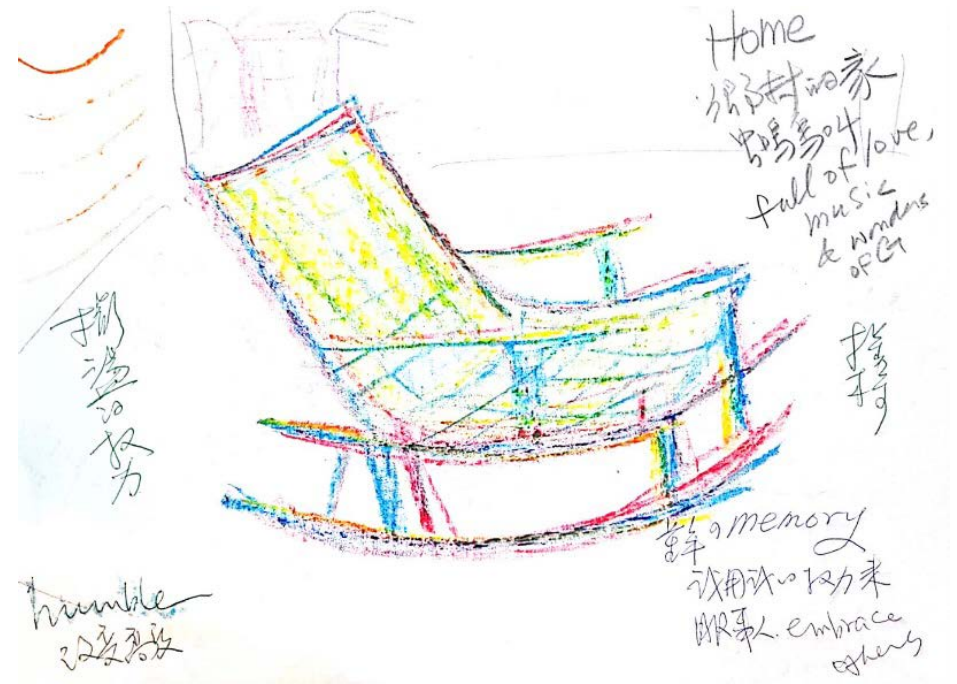
Figure 9. In the drawing, a rocking chair is patterned with cross-crossed lines in interwoven hues of yellow, green, red, and blue. The lines serve as pathways in horizontal and vertical directions through the intricate weaving of recurring struggles in life, and the need to navigate the realms of both elevated and humble powers. The rocker intimately connects with the soothing memories of enduring familial ties. Reproduction of the drawing courtesy of the participation in my art devotion group.

She drew a rocking chair in which the movement symbolizes the sway of power. During our art devotion session, in speaking about her rocking chair drawing, she described memories of her childhood home and the how rocking sound induces memories of the sounds of insects she heard in her youth and the feeling of a loving home. The phrase 'change in height' on the artwork (see Figure 9) demonstrates the potential to assist more people through the authority of the priesthood. The overlapping colors weave together a sacred light and a cross, and although the space may be empty, the brightness shines into the future, extending infinitely. This imagery resonates with the struggles and discrimination faced by female pastors in a patriarchal society, as if they find themselves in an endless expanse, constantly needing to challenge and overcome various obstacles as a leader in the church.