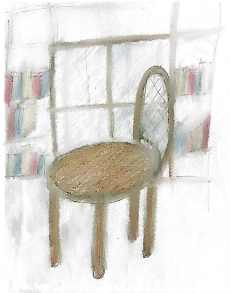
Figure 8. The first women presented the chair with color pencils in the study room. In the center of the painting, there is a wooden chair with a woven backrest, which represents a women in the room and symbolizes female empowerment. Placed with strategic precision amidst the surroundings, the chair occupies a space where a large window, cabinets, and books coexist in a well-lit and reflective ambiance. The background is represented with simple line and light colours showing the sun light from the big window. Reproduction of the drawing courtesy of the participants in my art devotion group.

Another participant in my art devotion group, a mother who has dedicated her life to experiences in Taiwan, London, and the United States, where her daughter pursued her studies, is proficient in preparing delicious Taiwanese food, and has a keen interest in unraveling the stories of characters from the Bible. Emphasizing female empowerment through biblical scripture study, she portrayed the chair as a symbol of strength, crafted from sturdy wood to mirror her resolute spirit (see Figure 8). Seated in this position of authority, during our devotion sessions, she often clutched a cherished book, peering outside at the swaying trees, passing pedestrians, and bustling express deliveries. Her devotion prayers tended to seek protection for her family and wisdom to confront upcoming challenges. The essence of her authority lies in self-discipline and a quest for divine blessings, epitomized by the chair gracing the study room.