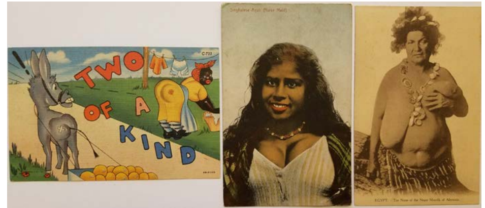
Figure 4. Divided-back postcards depicting non-White nursemaids as sexually repulsive.

Visual construction of the “colored” caregiver as the non-sexual, non-familial “other,” was, thus, crucial to the construction of the White family’s Whiteness. Postcards of the desexualized mammy, ayah, and baboe, upheld the sexual morality of White men, and the respectability of White women. In rare cases, when postcards focused on the nurse’s buttocks or breasts, the women were not portrayed with the pornographic sensuality of the thousands of erotic postcards of Black/Brown women in “harem” or “ethnic” settings (e.g., Algerian or Rodiya women). The exaggerated buttocks of the mammy compared to a donkey/ass, or the large breasts of the ayah, spilling over her blouse, represent a ridiculous excess, comparable to French colonial postcards of African nursemaids, which even in their nudity were meant to represent sexual repulsiveness (Figure 4). Exaggerated dark skin, thick lips, or monstrous body parts marked Black/Brown nursemaids as the antithesis of desirable White femininity. Animalized and grotesque representations further desexualized non-White nursemaids, implying that sexual relationships were unimaginable with them, which, by extension underlined the racial purity of the White family.