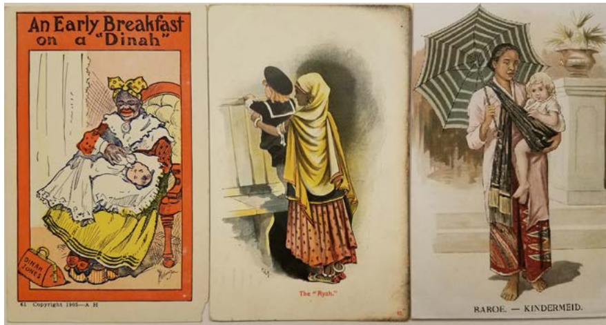
Figure 1. Postcards of exoticized and romanticized nursemaids from the early 1900s. 2

Historians of empire typically study domestic labor relations between Europeans and Asians/Africans in the context of European colonialism (Ghosh, 2006; Stoler, 2002). Historians of the United States, on the other hand, usually situate interracial domestic labor in histories of slavery and abolition (White, 1999) or immigration (Urban, 2017). Looking at interracial domestic labors beyond area-studies contexts, in a broader inter-imperial trans-national framework, not only leads to productive comparative analysis but points to congruencies in imperial projects across nations and empires. Ann Stoler (2001), who spearheaded the “intimate turn” in imperial historiography, emphasized the need to bring together postcolonial studies and North American history, which have remained “two distinctive historiographies” despite their common concern with “how intimate domains – sex, sentiment, domestic arrangement, and child rearing – figure in the making of racial categories and in the management of imperial rule” (p. 829). Unfortunately, little attempt has been made in this regard. Drawing inspiration from Stoler (2001), I bring into conversation early-twentieth-century North American and European imperial constructions of non-White intimate caregivers. The comparative focus using mass-circulating postcards enables us to understand the connected global history of imperial domestic sentiments and racialized gendered stereotypes.