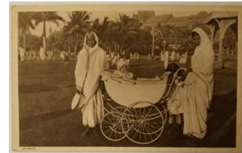
Figure 17. Divided-back postcard of two ayahs in Bombay.

Unlike the messages in European ethnographic postcards, messages in US racist postcards were rarely descriptive of the visual subjects, although some messages they appreciated the racist humor in postcard images. For example, a postcard, sent by a father to his son at a children’s hospital in Boston, while not directly engaging with the animalized mammy reference, asks, “aren’t these bears funny Kenneth?” (Figure 19). Messages in postcards—exchanged between family members and friends, and particularly when sent by parents to children—played a pedagogical role in perpetuating exotic, racist, and sexist stereotypes about “colored” maidservants.