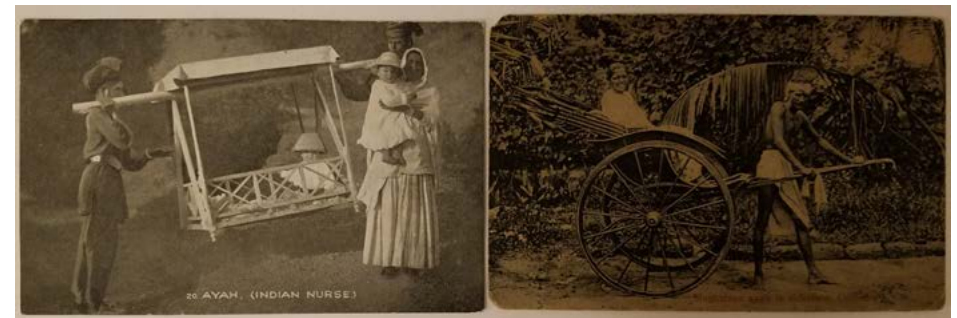
Figure 13. Postcards of ayahs in exoticized settings.

Picture-postcards advertising household goods, blatantly reinforced the role of African-American and Asian women as domestic servants. Turn-of-the-century manufacturing companies, in their mass-marketing of quotidian commodities, utilized what Ann McClintock (1995) describes in the context of Victorian Britain as “commodity racism” (p. 209). Victorian trade-cards, which were the predecessors of advertising postcards, popularized a racist and gendered domestic labor order while advertising ordinary household commodities like Clothes-wringers, Crown-dressing, or Stove-polish (Figure 14). Black maidservants were used as the foil to promote the cleanliness of White women’s