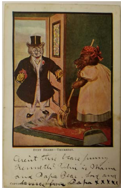
Figure 19. Undivided-back postcard of a mammified bear.

Postcards of non-White nursemaids, although marketed for White Euro/Americans, were frequently produced through non-White labor. Many popular imperial postcards, including that of an ayah pushing a British baby in a pram, were based on paintings by the Indian artist M.V. Dhurandhar (Figure 3). Ethnographic sets of Indian domestic servants, printed in Germany and collected widely by Europeans, were published by the Indian firm Moorli Dhur & Sons in Amballa (Figure 13). Not only were the illustrators and photographers often Black or Brown men, even the women who posed for postcard images as ayahs, baboes, and mammies were Asian and African-American women. Despite the pretense of ethnographic postcards to objectively capture “types,” such postcards of ayahs, mammies, and baboes, unfortunately, do not tell us much about the lived realities of their lives and labors. Postcard manufacturers staged and performed these “type” photographs, anticipating Euro/American consumption demands. Postcards, thus, reveal Euro/American fantasies and anxieties about racialized nursemaids. Sentimentalized, ethnographic, and racist postcards of non-White caregivers, however, obscure the actual experiences and social histories of these women.