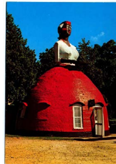
Figure 20. Modern postcard of Mammy’s Cupboard Restaurant