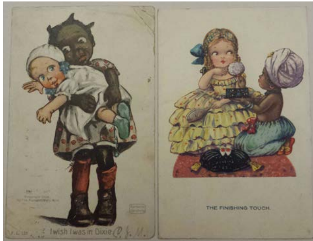
Figure 16. Cutification of racialized domestic labors.