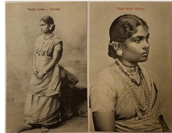
Figure 12. Ethnographic postcards of a Tamil ayah.