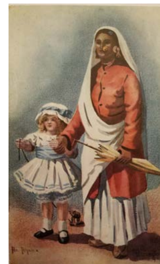
Figure 7. Tuck's oilette postcard of an ayah.