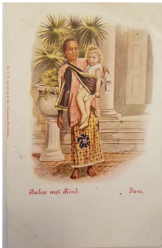
Figure 8. Romanticized postcard of a baboe.

During the early decades of Indonesian nationalism and demands for self-rule, the figure of the baboe was similarly romanticized in Dutch colonial memory. From Dutch imperial family photographs to children's ABC books like the Nieuw Indisch (Heyden, 1925), the Indonesian baboe in her colorful sarong taking the Dutch baby for a perambulator ride, or lovingly wrapping the baby in her slendang (shawl) came to represent the perfect picture of interracial harmony. The inter-imperial idealization of racialized nurses is noticeable from a Singapore-based English-language newspaper's praise of the Indonesian baboe: "How faithful and lovable these 'Babu Anak' can be is well known to all who have lived in the Dutch islands" (The Straits Times, 1939). Dutch memoirs of the Japanese occupation in the 1940s recall loyal baboes who looked after their imprisoned Dutch masters' children without expecting payment (Stoler, 2002). The sentimentalized postcards of the baboe with the Dutch child ("baboe met kind" as noted on the postcard in Figure 8) are similar to the mammy and the ayah postcards in representing imperialism and racial hierarchies as affectionate relationships.