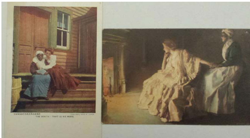
Figure 5. Postcards romanticizing the mammy.

abolitionist accusations of slavery's violence and inhumanity (Wallace-Sanders, 2008). The enslaved mammy's fidelity meant that her relationship with the White family depended on genuine familial affection, rather than crass market contracts of free labor (McElya, 2007). Even anti-slavery fictions like Uncle Tom's Cabin (Stowe, 1852) had romanticized the Mammy and perpetuated her image as an icon of Black slave motherhood. Postcards idealizing the mammy drew from these older traditions of loyal slave-women as well as from early-twentieth-century fictions and films glorifying the old American South. In D.W. Griffith's 1915 epic movie, The Birth of a Nation , set in the 1860s, the mammy defends her master's estate against Black and Union soldiers, who are fighting to emancipate slaves like herself. In the 1939 classic film, Gone with the Wind , based on the eponymous novel (Mitchell, 1936), also set during the civil war, the iconic mammy completely identifies with her White mistress. Postcards reproduced this imagined idyllic love between the mammy and the Southern belle, which became the symbol of the "The South – that is no more" as stated on the postcard in Figure 5. Catering to early-twentieth-century US nostalgia for old paternalist racial domestic hierarchies, postcards contributed to the maternalization and mythification of the mammy.