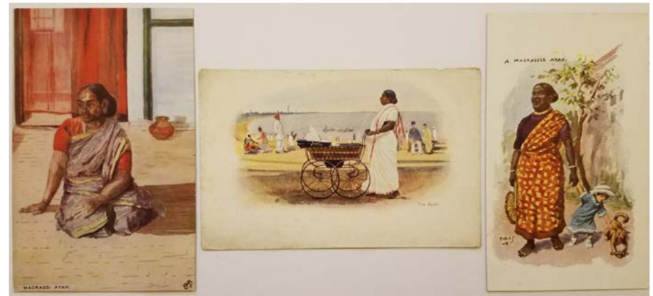
Figure 3. Undivided-back postcards of ayahs with big bodies and dark skin.

Asian women. 4 In the absence of British women in late-eighteenth and early-nineteenth-century India, British clerks, soldiers, and sailors cohabited with Indian mistresses called bibis , who also functioned as their domestic servants (Ghosh, 2006). The colonial state gradually started professionally penalizing British men who had Indian mistresses and half-caste children (Dalrymple, 2003). Therefore, British men guarded their socially shameful secret interracial relations, bibis , and Eurasian children. British women were shipped to India in order to form racially pure British families. The asexual image of the Indian ayah as a lady's maid and nursemaid for British families, ensured appropriate racially channelized sexual relationships between the British master and his British wife, at least in the imperial public imagination. Mass-circulating postcards of the desexualized dark-skinned, sari-clad, elderly, obese Indian ayah erased the widespread history of domestic concubinage from British imperial biographies (Figure 3).