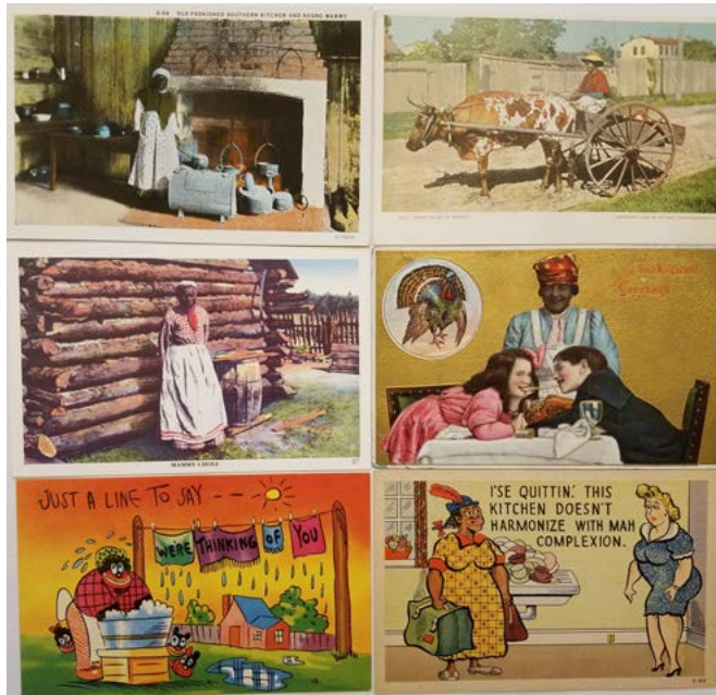
Figure 10. Postcards naturalizing Black women's role as maidservants.

of Black women. Postcards drew on the antebellum history of slave-women's domestic labor and post-emancipation reality of lower-class Black women's predominant occupation as servants for middle-class White families. Thousands of copies of postcards like "Negro Mammy" in an "old-fashioned Southern Kitchen," "Mammy going to Market," or "Mammy Chloe" taking a break from work, reinforced notions of the natural position of Black women as maidservants (see Figure 10). While economic segregation pushed Black women into menial domestic roles, postcards depicted the Black mammy providing household service in the White home with a constant smile on her face. The black-faced mammy in the Thanksgiving postcard, for instance, beams with contentment as she brings in the turkey she has cooked for the White master's children. (See Figure 10.) Reproducing the caricature of the happy slave, the intensely racist linen postcard of the mammy washing clothes shows her and her animalized children smiling widely. The mammy's subhuman appearance, ignorance and broken English – "I'se quitting" (Figure 10) – implied that she was inferior to White women, and only suited for menial chores, which she herself happily accepted. The idea of her "quitting" this role was marketed as humorous to the postcard's consumer.