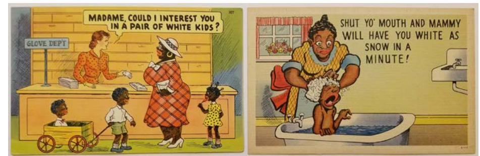
Figure 9. Linen postcards mocking the mammy's supposed preference for White children.

is good; black child his slave'" (Darton, 1910, p. 402). White American cultural representations similarly typecast mammies as slavishly devoted to their master's White children, but rude and dismissive towards their own Black children. Postcards amplified the stereotype. For example, an American linen postcard, shows a Black woman with three Black children, asked by the White saleslady at a gloves counter, "could I interest you in a pair of white kids?" Kid gloves—made of white leather from young goats—were mostly used by butlers and maids in this period. This suggests a double pun - the Black woman's natural role as servant, and her secret wish to take care of White children despite having three children of her own. In another linen postcard, a mammy desperately washes her wailing Black child trying to turn him White: "mammy will have you white as snow in a minute!" (see Figure 9). Cultural constructions of the non-White nursemaid's desire for White children rationalized the political and socio-economic systems that severed so many Black and Brown nursemaids from their own families, rendered them kinless, and denied them the right to marry or have children, in order to serve White families.