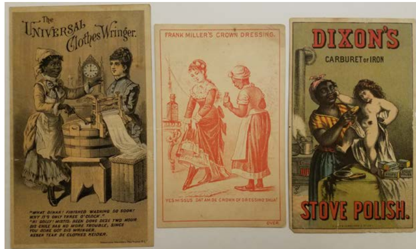
Figure 14. Victorian trade-cards.

bodies and homes. Freely-distributed advertising postcards in the early-twentieth-century continued using the bodies and labors of “colored”/colonized women to sell domestic commodities (Figure 15).