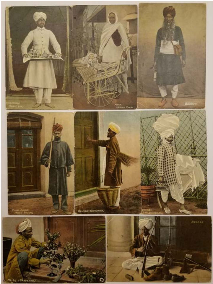
Figure 11. Postcard set of Indian servants by Moorli Dhur & Sons, printed in Germany.

however, is expressed through the numerous ornaments on their bodies. In the frontal and profile “type” postcards of the Tamil ayah (Figure 12), for instance, the numerous necklaces, nose-rings, earrings, toe-rings, bangles, anklets, and hair ornaments not only demonstrated her exoticness, but also indicated to European consumers how well she was provided for by her benevolent imperial masters. In reality, ayahs were unlikely to have possessed expensive ornaments. Placing the ayah in front of a dhooli (Indian cradle), or on a ricksshaw , further demonstrated British indulgence of her “Oriental” lifestyle (Figure 13).