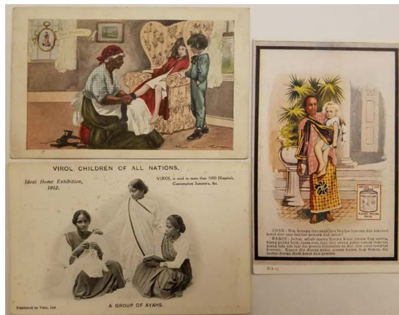
Figure 15. Advertising postcards.

In the “Walk-Over” shoes postcard (Figure 15), for instance, the image of the mammy subserviently kneeling on the floor and putting boots on her young mistress’s feet, was no doubt intended to pamper the racial privilege of potential White customers. The Virol postcard, advertising the “wonderful Food for Children and Invalids,” used an image of three Indian ayahs from the 1912 Ideal Home Exhibition in London, to expand Virol’s market to Britain’s empire with the caption: “Virol Children of All Nations” (Figure 15). Drawing upon the turn-of-the-century obsession with scientific childcare, the Soesoe Tjap Nonna postcard advertised Condensed Milk using the figure of a baboe carrying in her slendang a healthy Dutch child (Figure 15). In the guise of explaining to the child (“Anak”), the baboe advertises to Dutch imperial families the health benefits of this particular baby product. Advertising postcards naturalized the roles of White women and children as domestic consumers, and “colored” women as domestic laborers and caregivers.