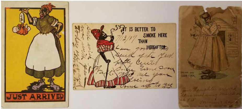
Figure 2. Undivided-back postcards of mammies with exaggerated features and large feet.

American historians have traced the elderly asexual obese stereotype of the mammy to mid-nineteenth-century Southern responses against Abolitionist characterization of plantation households as sexually degenerate sites of miscegenation (McElya, 2007; White, 1999). Anxieties about Black women as promiscuous Jezebels who lured White men to bed, supplemented by fears about White male lust for Black women continued in the period of Jim Crow laws. The myth of the asexual mammy disseminated widely across the segregated nation through early-twentieth-century postcards, cloaked the long antebellum history of coerced sexual and reproductive labors extracted from slave women's bodies. The mammy's exaggerated features, large feet, amplified Blackness, and shapeless overweight masculine body in the postcards (Figure 2) perpetuated the notion that Black women were undesirable. Thus, White men's pervasive sexual violence against Black women – not legally recognized as a crime in early-twentieth-century America – also appeared improbable.