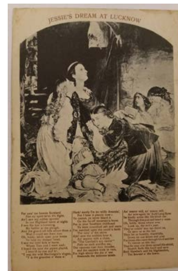
Figure 6. Postcard commemorating the Indian mutiny.

diaries how "many an ayah in the Mutiny proved her devotion at the cost of her life, and many would do so again" (King, 1884, p. 130). An early 1900s postcard created a mass-circulating mutiny memorabilia by juxtaposing an old Mutiny ballad, on the legend of a brave Scottish lassie in Lucknow, with Joseph Paton's mutiny painting In Memoriam (1858), which depicted a red-bordered sari-clad ayah (the second woman on the right in Figure 6) holding a British girl on her lap and hiding fearfully with British women to escape the mutineers. Inserting the loyal Indian ayah in imperial visual memory of the anti-British Indian Mutiny, reaffirmed the affective domestic ties between British families and their colonial maidservants, even at the time of colonial resistance. Tuck's "Native Life in India" postcard series (1908-1914) described on the back of the postcard of an ayah: "They frequently become greatly attached to the European children in their charge, the inevitable parting eventually causing them great distress" (Figure 7). This heartfelt maternal love, and "great distress" at separation was a testament to British employers' kind treatment of Indian ayahs, at least in the postcard consumer's mind. In the backdrop of early-twentieth-century Indian nationalist critiques of British despotism and Gandhian mass-movements against British rule, imperial postcards of ayahs disseminated an emotionally and politically powerful message of Native devotion.