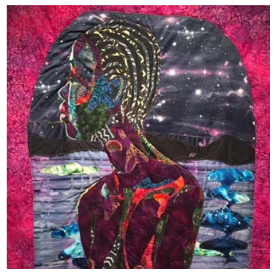
Figure 4. © Bisa Butler, Australopithecus, 2005 silk, linen & cotton, 60"X44"

Butler believes the U.S. society pushes Black women to forget who there are and what they do the best. In feeling her ancestors may have been weavers on a planation, locating the meaning of her artwork is the process of reclaiming their art. Butler looks at the historical aspect of the origin of humankind through a Black woman lens in her creation of Australopithecus (Figure 4), named Lucy, the first human bones that were found to be Homo Sapiens from the continent of Africa. Butler is visually asking the age-old question of who are we and where do we come from? Australopethecus is Butler's expressing of how she sees the first human arising out the primal waters, looking at the background galaxy, and an unformed Earth is a Black woman.