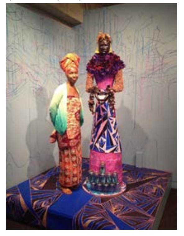
Figure 3. ©Karen Seneferu, Techno Kisi 5, 2011, mixed-media

Seneferu learned that Black women are hungry for images of themselves through art as a form of expression to reflect their importance in what they do in the world. Seneferu recognizes the importance of African aesthetics as a vehicle for creating self-actualization in locating the meaning in her artwork as a Black woman. Similar to Washington, African spirituality influences Seneferu's artwork with the Nkisi.<sup>10</sup> Producing Techno Kisi 5 (Figure 3) is combination of merging technology and ancient spirituality to create contemporary artwork. Seneferu observed a little girl who walked up to Techno Kisi 5 and plugged into the earphones and watched the video about the importance of perceiving God as a Black woman. She believes mythmaking is important for a community to be alive as she observed in stating: "As a Black female artist, I have the ability to create work, [which] reveals that our culture is not dead" (Seneferu, personal communication, November 8, 2015).