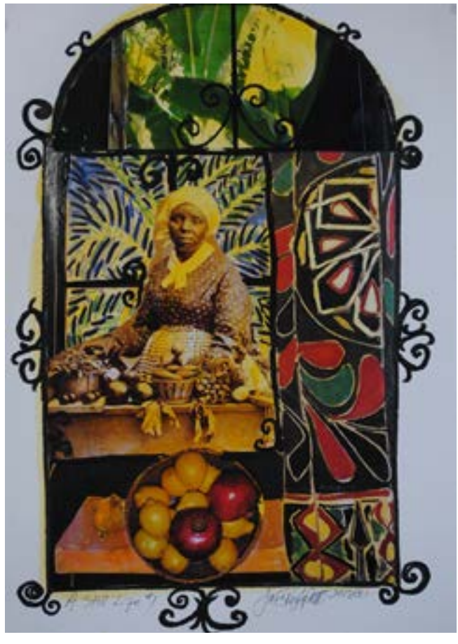
Figure 1. © Janet Taylor Pickett, A Still Life #1 , 2013, mixed media & collage on paper, 15"X11"

a domestic worker because I work at home. I am a mother, I am a divorced woman who raised a daughter and who worked sometimes three jobs. ... [I] couldn't depend on anybody else for that income but me and so sometime that artistic life had to be stilled, to be stopped in order to take care of the main responsibility in my life, which was my daughter" (J. T. Pickett, personal communication, October, 27, 2015). A Still Life No.1 is more than a collection of fruit and vegetables. The use of vintage photographs, the Black woman standing in the kitchen as a domestic servant represents the symbolic layers of discrimination and oppression that Black women endure.