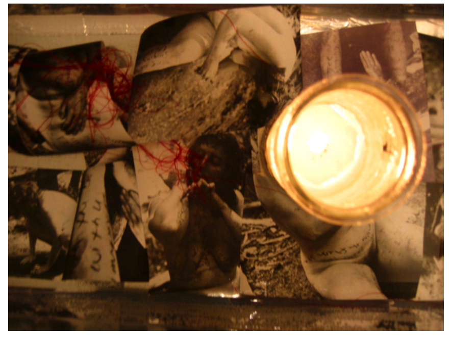
Figure 3. Detail of "To find traces of her estrangement" (Bickel, 2004)

"Sacred" is the name we give to the deepest forms of receptivity in our experience" (p. 69). In order to break the cultural and habitual voyeuristic viewing of the photographs, the photos were submerged in water, illuminated by two tall glass-encased white candles that ritually burned throughout the entire show. A ritual vigil is suggested by the candles burning above the waterline, and eventually burning below it throughout the duration of the exhibition. The water, along with floating red threads, embodied the metaphor of life's blood, acting as a protective veil over the photos. Through ritual, water takes me to alternate realms, into places of mystery. Placing the photos under water symbolically required the viewer to leave the familiar element of air and to pass visually through to an alternate realm (water) in order to gain access to the images.