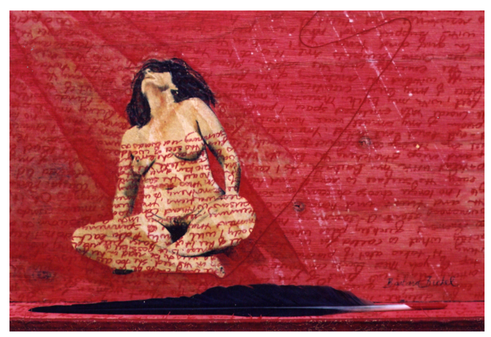
Figure 5. Photograph by Barbara Bickel (2004) of a detail of her work, "Spinning Red Words on Wood" in Who will read this body? It is mixed media on wood, 22 x 12 x 2 inches.

I have struggled with the limitations of the modern art world and the role of the artist within it. I wrote on the photo, filling the naked wall, uncovering another layer of hesitancy and inhibition in the spontaneously written text. The text is secondary, its appearance marks the challenge to move through my embarrassment and shame of its a-rational, stream of consciousness content. The a-rational, as a form of knowing includes the body, the emotions, the senses, intuition, the imagination, creation making, the mystical, spiritual and the relational, alongside the rational. The documented installation photo reveals the metaphoric death and return of a long censored part of myself, my voice. The words that had long been stored below the waterline of my body surfaced and were infused with renewed breath and understanding in this living inquiry.<sup>1</sup>