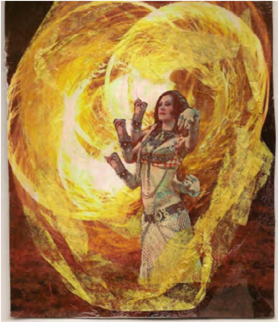
Figure 2. The Sun Tarot Card by Nicole Leyland, 2016.